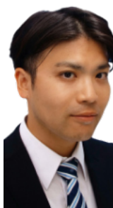
Dr. Yoshitaka Nishikawa

Optimizing health promotion strategies for improved health system resource allocation: lessons from Ghana's COVID-19 pandemic response