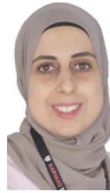
Second-year Takemi Fellow