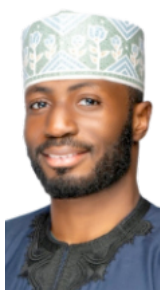
Second-year Takemi Fellow